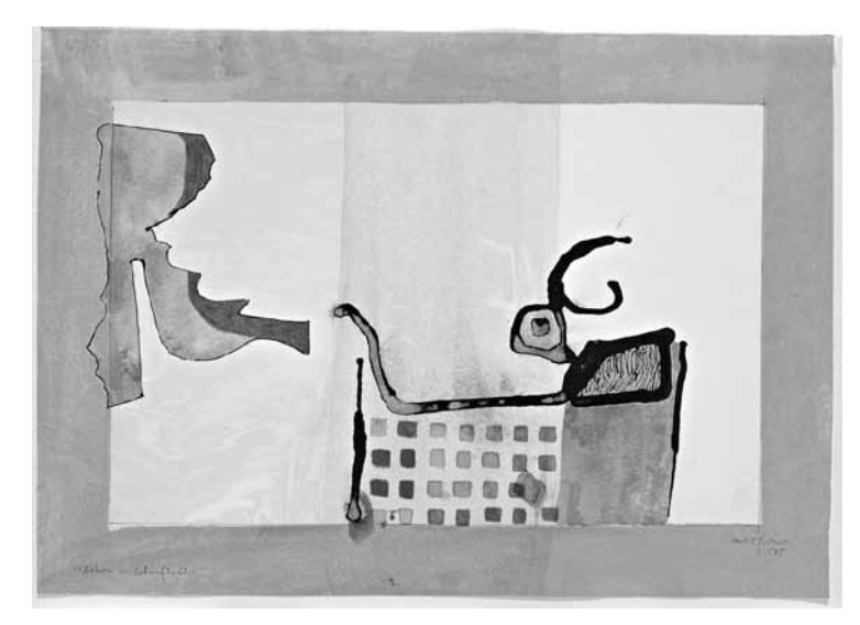
Imre Reiner, Stilleben in Schriftnähe, 1975.

Different workshops and meetings were held at the ECML in order to bring together practising teachers and disseminators from all over Europe and learn about their ideas and experiences. The teachers provided the project team not only with many practice examples, but engaged in intensive discussions about the plurilingual approach behind the project and how the knowledge gathered could best be structured.